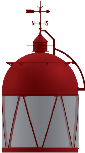
LEM lanternhouse example.

Specifications subject to change without previous notice.