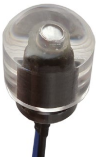
FR 20 ATEX versión

! Specifications subject to change without previous notice.